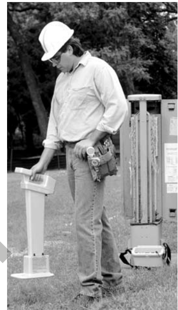
The 3M™ Dynatel™ Advanced Cable/Fault Locator 2273 can be used with the 3M™ Dynatel Marker Locating Accessory 2205/2206 EMS.

For cable path locating, the 2273 advanced cable/fault locator receiver uses one of four user-selected locating modes – dual peak, dual null, differential or special peak (which increases the sensitivity of the receiver for tracing over longer distances). The mode is selected depending on which is most effective under the locating conditions.