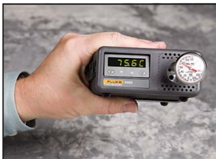
Take the 9100S anywhere. It's the smallest dry-well in the world.

Since we introduced the world's first truly handheld dry-well, many have tried to duplicate it. Despite its small size (57 mm [2¼ in] high and 127 mm [5 in] wide) and light weight, the 9100S outperforms every dry-well in its class in the world.