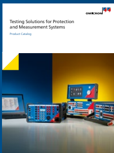
Product catalog (secondary equipment)

The following publications provide detailed information on the products described in this brochure and their applications: