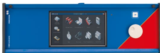
CMControl-6 Front Panel Control (option)

Besides its operation with the powerful Test Universe software running on a PC, the CMC 356 can also manually be controlled with the highly flexible CMControl unit and the CMControl App running on an Android Tablet or a Windows PC. For more information please visit our website.