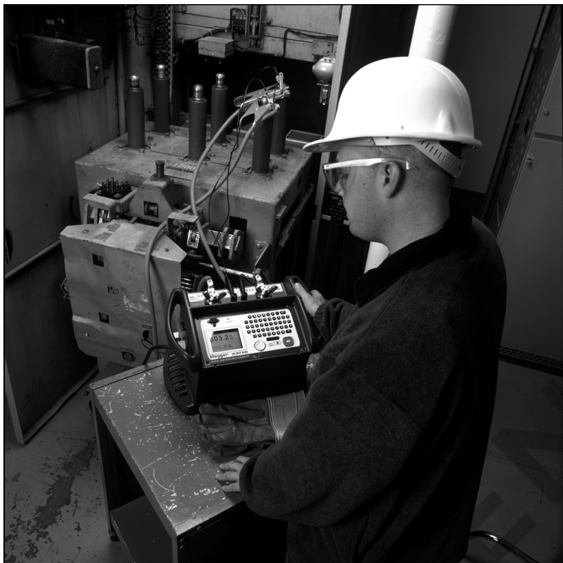
The DLRO600 shown measuring the contact resistance on a GE 15kV air breaker.