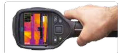
Auto-orientation keeps diagnostics overlays upright