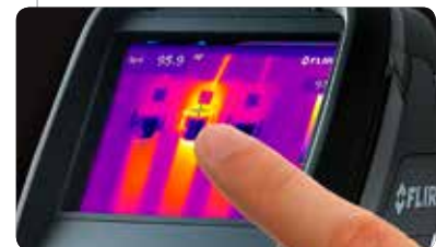
Large 3.5" touchscreen