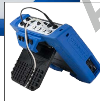
Easel and Wire Management

Innovative Package & Wide Screen 7" color, wide screen touch display. 40% larger than before - the largest in the industry!