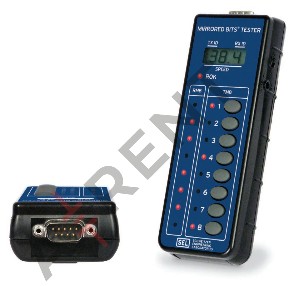
Reduce commissioning and repair time.