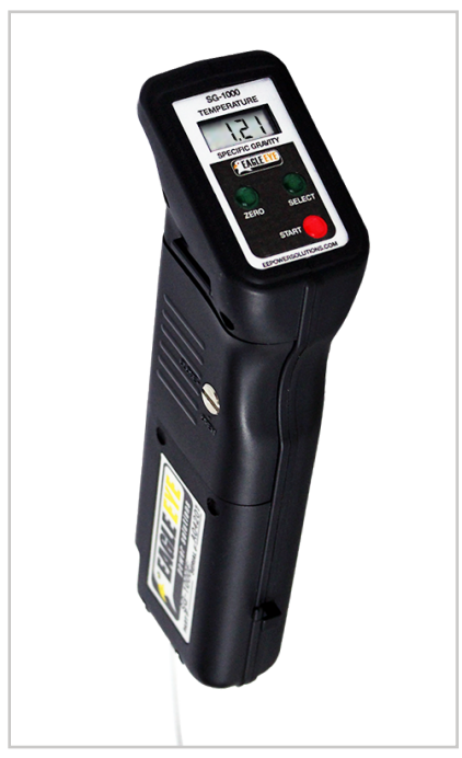
SG-1000 Battery Digital Hydrometer