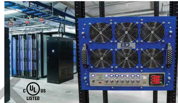
SL20 20kW/240VAC Server Rack Heater