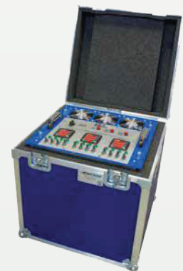
SL9 with Optional Travel Case

According to the American Society for Heating, Refrigerating and Air Conditioning Engineers (ASHRAE), commissioning is the "quality-oriented process for achieving, evaluating and documenting that the performance of buildings, systems and assemblies meets defined objectives and criteria."