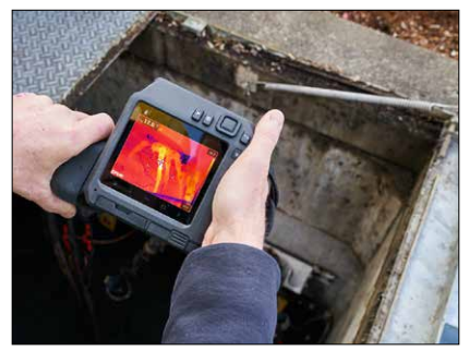
Up to 161,472 pixel resolution for accurate readings on distant targets