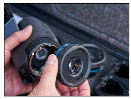
Share lenses (wide angle to telephoto) across your fleet of cameras thanks to AutoCal™ optics