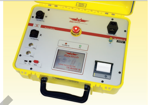
TR-Mark III 250V