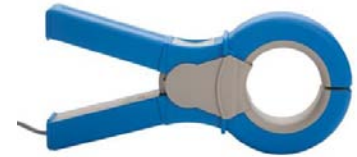
TR-2530B 20A-300ARMS CT