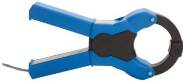
TR-2500B 10A-500ARMS CT