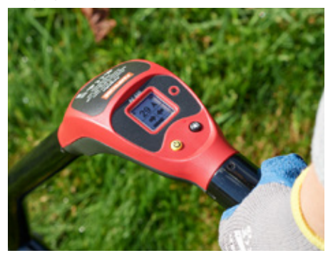
Clearly view the LCD display in bright sunlight