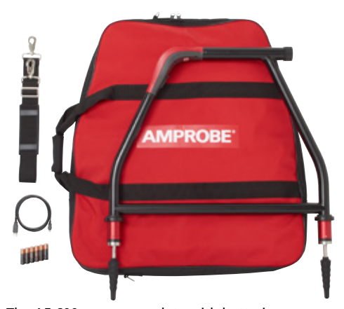
The AF-600 comes complete with batteries and a carrying case