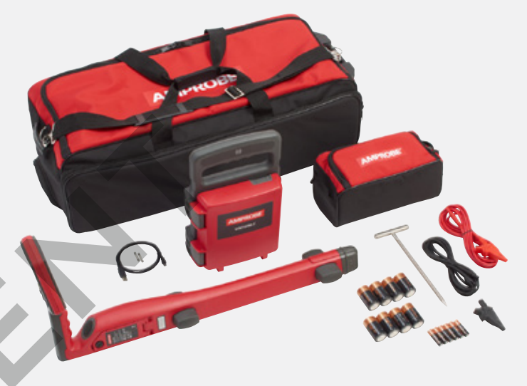
UAT-610 Underground Utilities Locator Kit