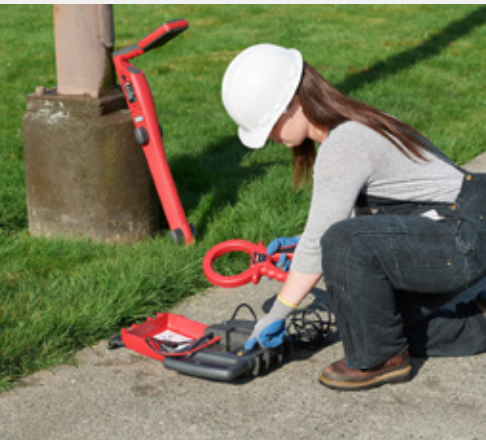
The Transmitter will automatically change modes based on which accessory is plugged in