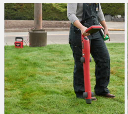
Trace an individual utility by connecting the transmitter directly with the test leads