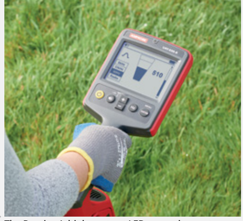
The Receiver's high contrast LED screen is easy to read in full sunlight