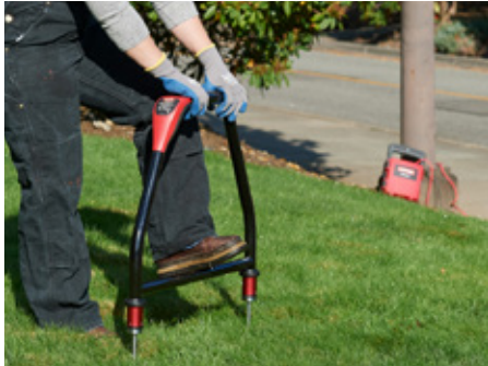
Pinpoint fault location by using the AF-600 with the UAT-600 Transmitter