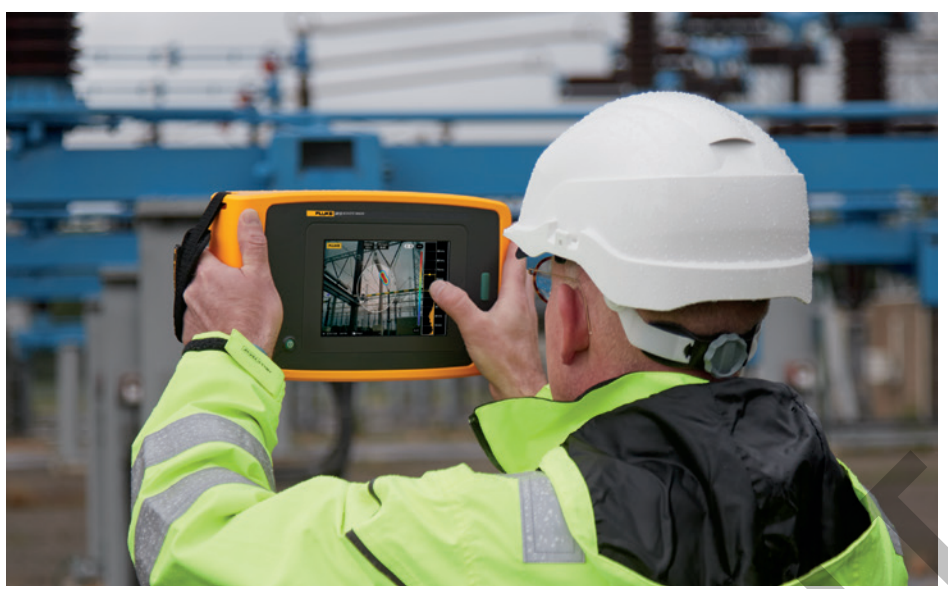
Image taken of the ii910 Precision Acoustic Imager detecting partial discharge in a high voltage application.